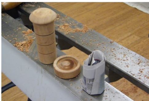
The finished set with paper pot.

Tip : damping the bottom edge of the newspaper makes it easier to form the pot.